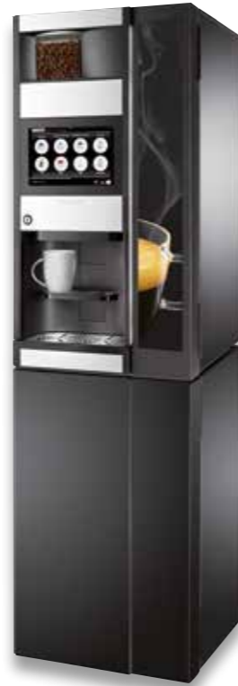
The elegant base stand enhances the design of the machine.